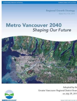
Metro Vancouver Regional Growth Strategy

The City of Langley was incorporated on March 15, 1955 and comprised an approximately ten square kilometre area of the Township of Langley that had been known as Langley Prairie. A significant business centre in the Lower Fraser Valley, the City of Langley was included in the Central Fraser Valley Regional District when the Province of British Columbia established Regional Districts in 1966. At that time the regional planning framework was provided by the “Lower Mainland Official Regional Plan” which was prepared by the Lower Mainland Regional Planning Board. The City’s Official Community Plan was required to be in compliance with the Regional Plan.