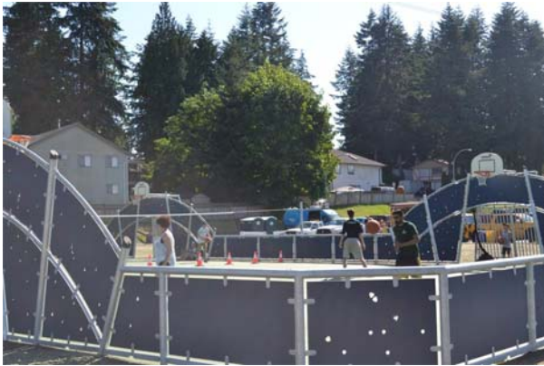
Multi-Purpose Sports Court