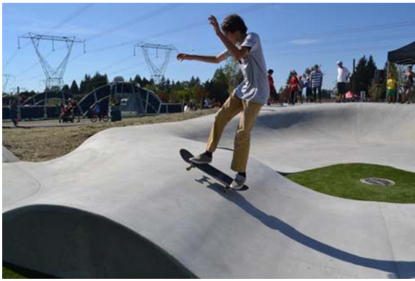
Concrete Pump Track