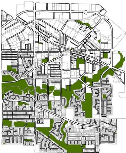
City of Langley Parks